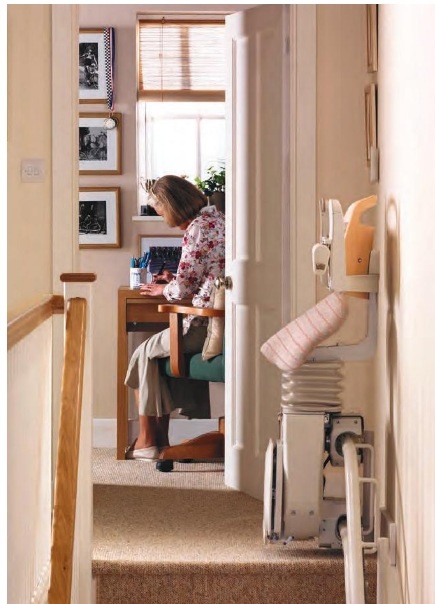
The Sadler's slimline design allows others to still use the stairs

The elegant Sadler is crafted for choice and ease-of-use in every way, with the chair folding away for a compact footprint allowing other people to continue to use the stairs. It's this level of thought and care that ensures that Sadler is the natural choice.