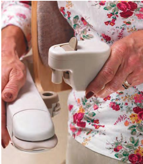
Seatbelt can be fastened with one hand

Effortless and simple. This sums up beautifully just how much thought and care we have designed into each and every function of our Sadler stairlift. From the safe and easy-to-use seatbelts, to stairlifts that fit on either side of the stairs and on all types of staircases, we have made your Sadler stairlift simple, safe and reliable.