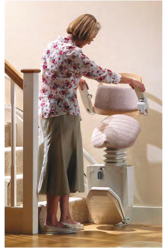
Fold the arms and the footrest folds automatically

“We are delighted with the stairlift. My wife enjoys the ride. It gives her independence. She finds it very easy to use”