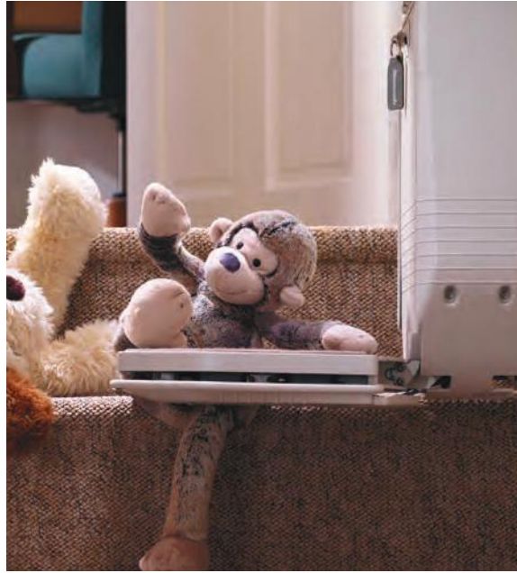
Sensors detect obstructions on your stairs