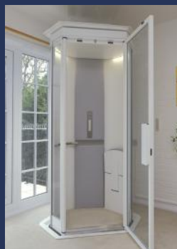
Lifestyle Home Lift

If you haven't previously considered a home lift, speak directly to the manufacturer and join the many customers who are experiencing the convenience and reliability of a Terry Lift. Call 01565 752 800 to ask any question, or to arrange a consultation.