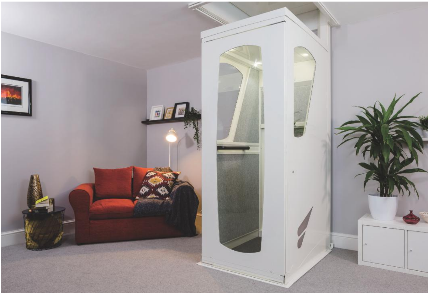
Toughened glass vision panels, as standard, give the car a solid feel compared to scratch-prone plastic alternatives