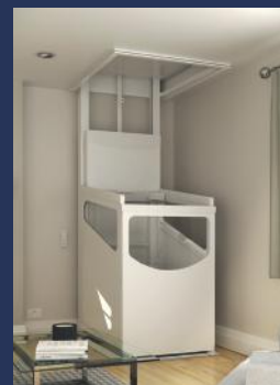
Harmony Home Lift