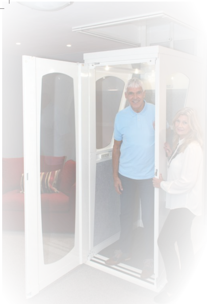
Harmony FE Home Lift

If you haven't previously considered a home lift, speak directly to the manufacturer and join the many customers who are experiencing the convenience and reliability of a Terry Lift. Call 01565 752 800 to ask any question, or to arrange a consultation.